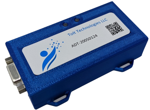
Ability Drive™ hardware