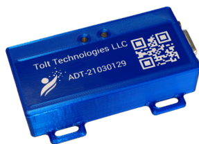
Ability Drive™ hardware

Ability Drive™ is a combination of hardware and an app. The Ability Drive™ app runs on an approved eye gaze device. The app senses your gaze on virtual buttons which send directional movement commands to the Ability Drive™ hardware interface. These buttons overlay the forward camera view. Looking at the stop button, looking away from the computer, or closing your eyes stops wheelchair movement.